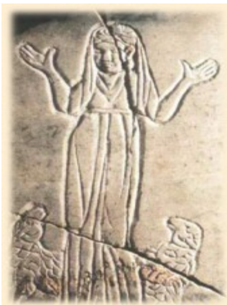
In the catacombs: A woman prays with her head covered

There can be little doubt about what application Paul intended the Corinthians to make of this passage. All their women were to cover their heads for prayer at least, both in the assembly and in less formal settings. In view of the customs of the time—in which many women would go about with their heads covered anyway—we might even say that this whole passage has to do not so much with putting on special coverings for prayer as it does with keeping the head covered for prayer.